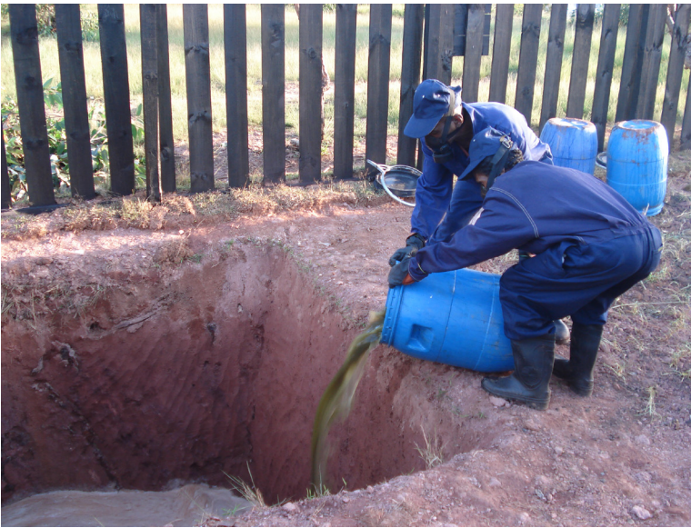
▲ Sanitation workers safely dispose of fecal sludge as part of WASHplus and the Practica Foundation's pilot program to make the process a viable business model in peri-urban Madagascar.

Through these partnerships, WASHplus has expanded its reach, learning, and effectiveness, developing a better understanding of how to bring improved WASH and household air pollution products and services to previously underserved communities and apply that knowledge to some of its larger country programs.